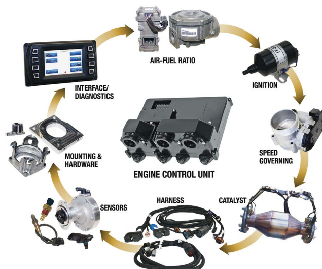
Diagram of System Overview

Contact your FW Murphy sales representative at www.fwmurphy.com .